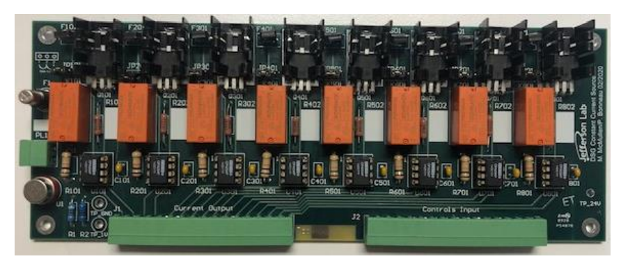
Populated Constant Current Source (CCS) board